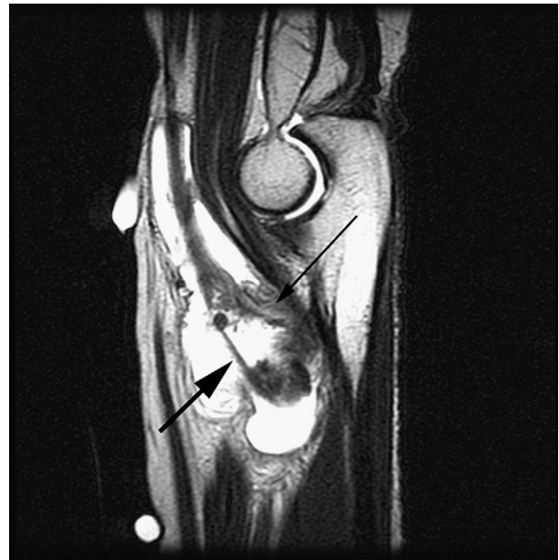
Figure 2 A 58-year-old office manager presented with a 4-month history of insidious antecubital fossa pain. She had swelling and a palpable cystic mass on examination. A T2 sagittal magnetic resonance image demonstrated a high-grade partial distal biceps tendon tear ( thin black arrow ) with only a few fibers still attached to the radial tuberosity ( large arrow ). The tendon is surrounded by fluid.

All patients presented with pain in the antecubital fossa, having had symptoms for a mean duration of 9.4 months (range 0.5-96 months) before evaluation. Seven cases could be traced to a single injury, and 8 reported the insidious onset of symptoms. Six patients noted swelling in the antecubital fossa, and 5 of these patients had a distinct palpable cystic mass on physical examination. One patient